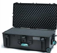
* cubed foam