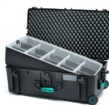
* second skin