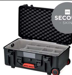
* second skin