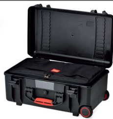
* interior bag