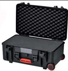
* cubed foam