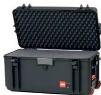
* cubed foam