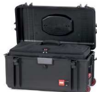
* interior bag