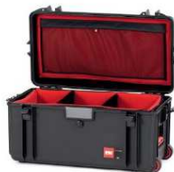
* soft padded open deck + dividers