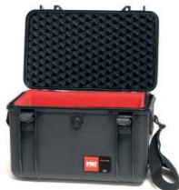
* soft padded open deck + dividers