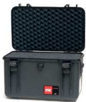
* cubed foam