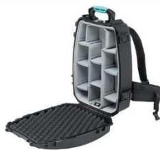
* second skin