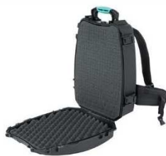
* cubed foam