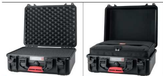
* cubed foam