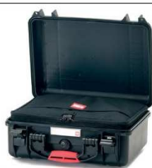
* interior bag