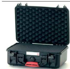
* cubed foam