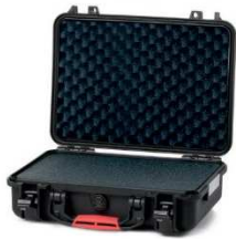
* cubed foam