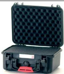
* cubed foam