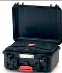
* interior bag