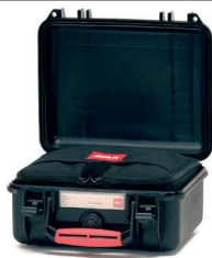
* interior bag