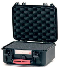
* cubed foam