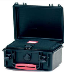
* interior bag