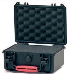
* cubed foam