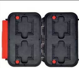
* memory card case