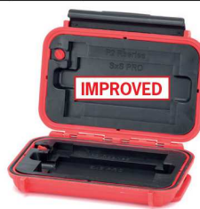
* memory Card Case for video