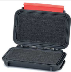
* cubed foam